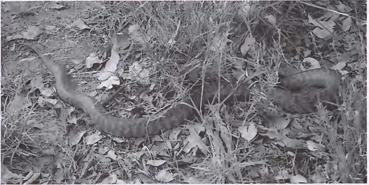
FIG. 3. An adult female woma python Aspidites ramsayi enlarges an existing burrow entry close to a sand goanna Varanus gouldii (potential prey) sighting moments earlier.

against the shrub for a further five minutes, the python slowly moved down into the burrow entry and disappeared. This woma had moved 400 m from its last known burrow and 55 hours after the digging observation, had moved a further 260 m to shelter in a well-established ground burrow system.